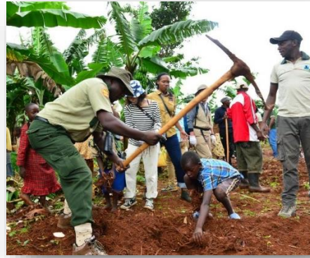
Bwindi Orphanage, and Stretch Hands, Uganda