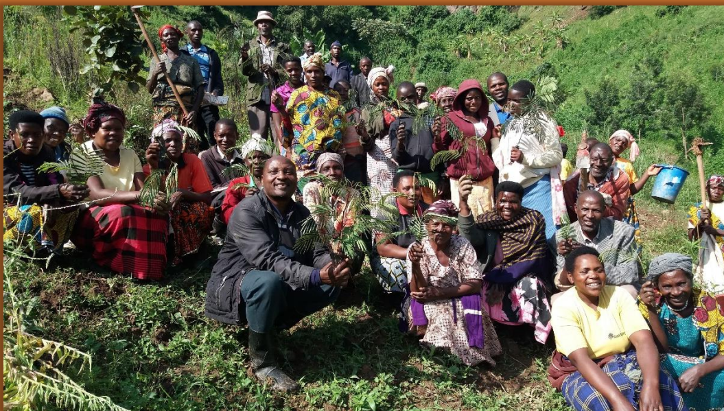
Ikamiro Community Landcare Association

We acknowledge elders past, present and emerging in our communities across the globe.