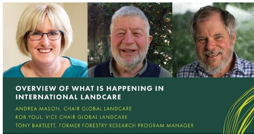
Landcare Australia National Landcare Conference Webinar Series