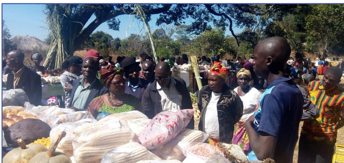
SOLWEZI DISTRICT FARMERS ASSOCIATION, ZAMBIA