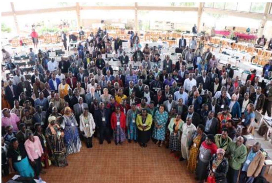
National Landcare Conference Uganda, Nov 2019

We acknowledge elders past, present and emerging in our communities across the globe.