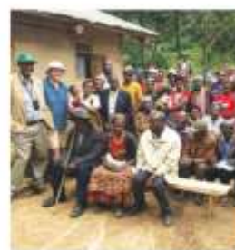
Commended: Strathallan Family Landcare and Mitta to Murray Blackberry Action Group

While in a meeting leading up to the G8 Summit in Italy in 2009, Hon. Tony Burke MP sat next to the Environment Minister for South Africa. She noticed that Mr. Burke was the Agriculture, Fisheries and Forestry Minister for Australia and said – 'Oh, you would be involved in Landcare!' She went on to say that Landcare is one of the best forms of foreign aid that Australia has ever provided South Africa. An extraordinary statement and testament to the work of ALI and of the local landcarers driving Landcare in South Africa.