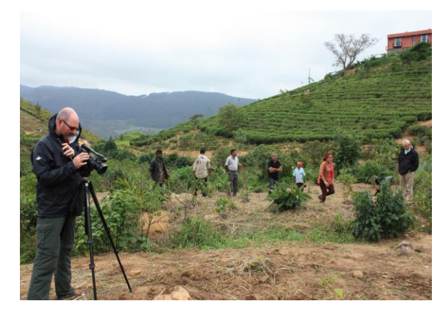
Filming on project sites

Over the past five months the Secretariat for International Landcare (SILC) has been coordinating the production of an educational video about Regenerative Agriculture and Landcare in Sri Lanka. The film footage was taken over 10 days in Sri Lanka in July 2013 in conjunction with She Oaks Films and with the support of Ballarat Region Treegrowers (BRT).